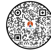
Resurrection Website Homepage

Please use these QR Codes to easily access our website and giving page.