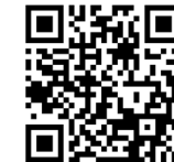
myvanco.com for Stewardship and Giving