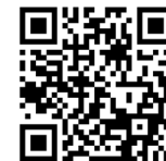
myvanco.com for Stewardship and Giving