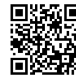
myvanco.com for Stewardship and Giving