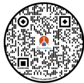
Resurrection Website Homepage

Please use these QR Codes to easily access our website and giving page.