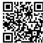
myvanco.com for Stewardship and Giving

Christmas flowers donated by various people—names will be in Christmas Eve bulletin inserts.