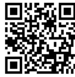
myvanco.com for Stewardship and Giving