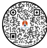
Resurrection Website Homepage

Please use these QR Codes to easily access our website and giving page.